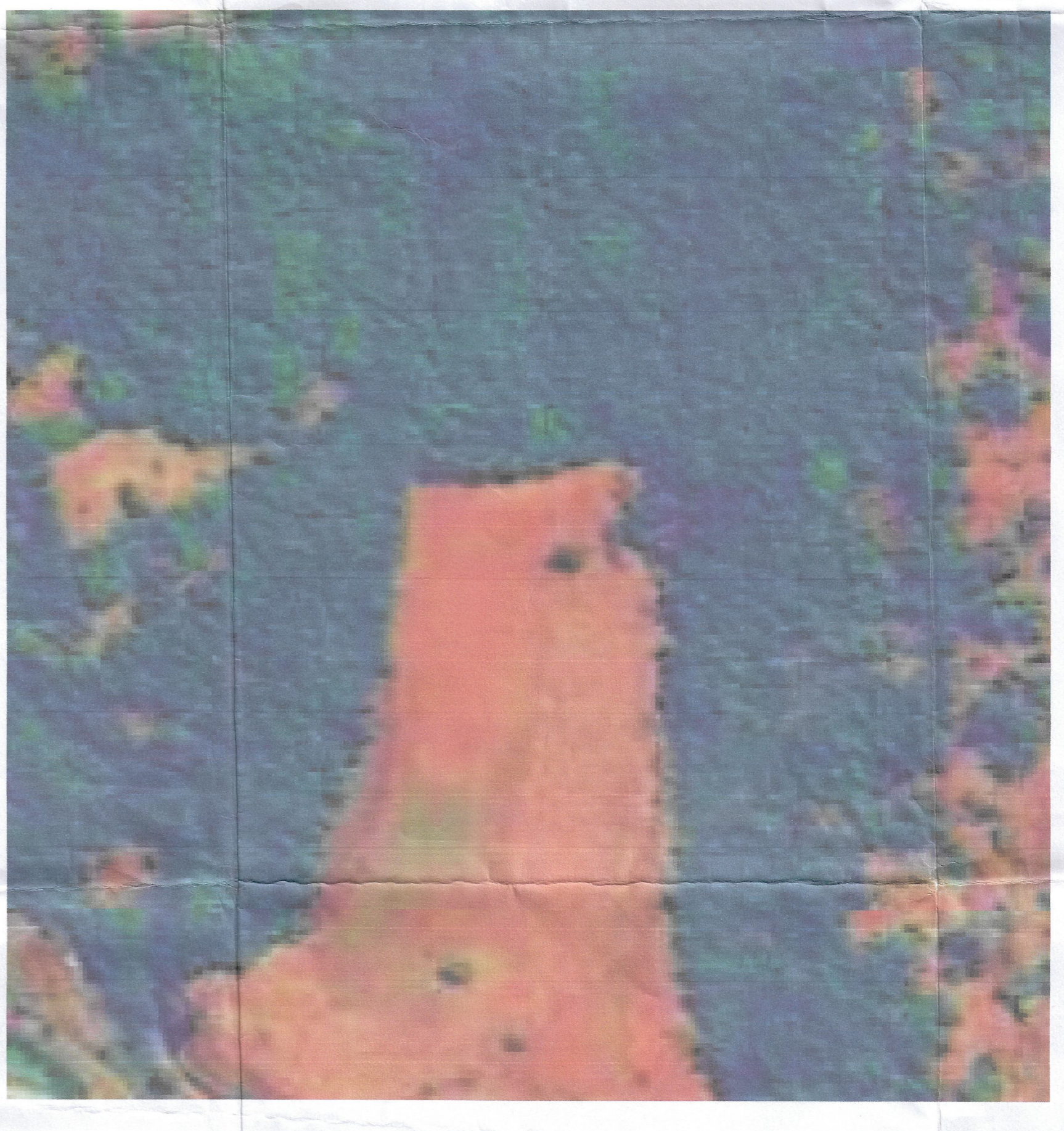
GOOGLE LOCATION PLAN SCALE: 1:500

NOTES: PLOT BOUNDARY COLORED IN BLACK PROPOSED WORK COLORED DOTTED IN RED PROPOSED ROAD SHOWN IN COLOR DOTTED GREEN ALL DIMENSIONS ARE IN METER